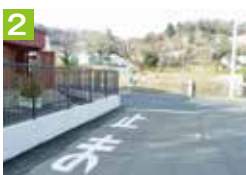
2 Area in front of the pre-school. Be extra careful of children in this area.