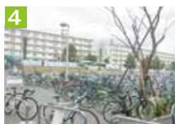
4 DO NOT park bicycles at campus entrances/exits. If there are no places to park, look for a place at another parking area.