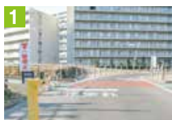
1 Intersection with footpath. You must stop at this intersection.

Take care when traveling through the five zones shown here as the danger of collisions with pedestrians or vehicles is particularly high.