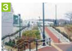
3 When moving between the road and parking area, cyclists must dismount and push their bicycles up the slope in the middle of the stairs. When descending too, cyclists must dismount.