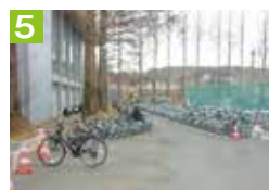
5 DO NOT park bicycles in front of the gymnasium entrance, as it hinders access to the building.