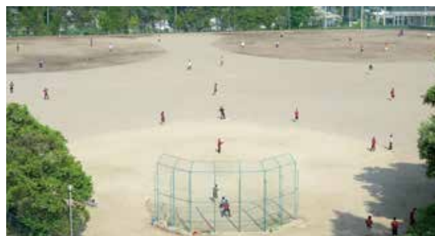
Kawauchi Baseball Field