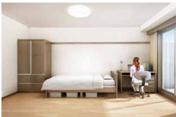
(Concept image of bedroom)

Open Living Rooms: 31.68 m 2 (1 per unit)