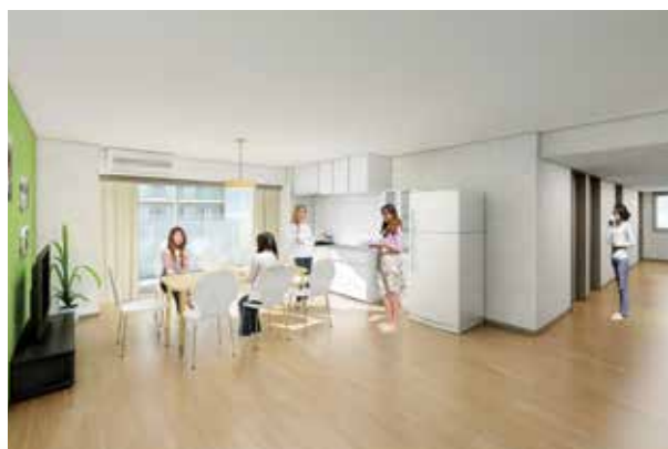
(Concept image of living room)