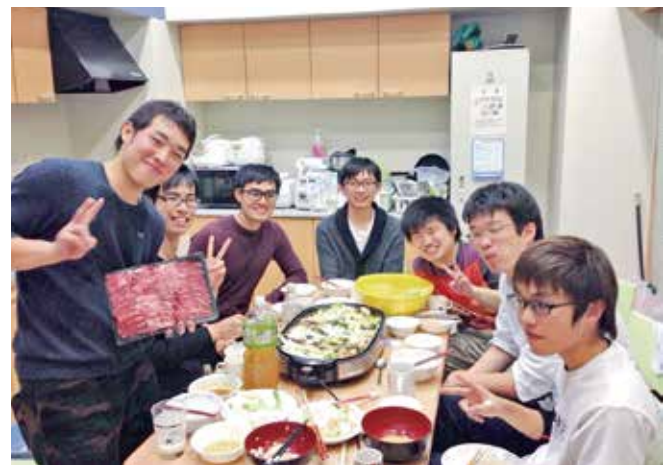
(Life in the units)

As a UH Advisor, I am working hard to provide the administration with ideas for improving UH and planning events so that the residents can lead a fun, fulfilling life here while concentrating on their academic duties and studies. By successfully planning a game competition and shaved ice stand for the August summer festival, I gained an appreciation for the challenges of facilitating cultural exchange between students from different departments and countries.