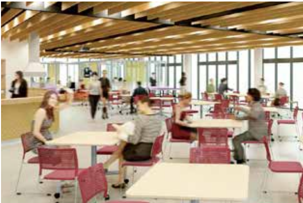
(Concept image of multipurpose room/lounge)

The multipurpose room and lounge will be partitionable, allowing the spaces to be adjusted as needed. The study room will seat over 100, and be suitable for holding lectures etc.